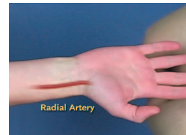
Location of the radial artery.