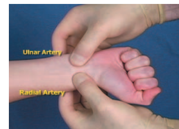
Performance of the Allen test.